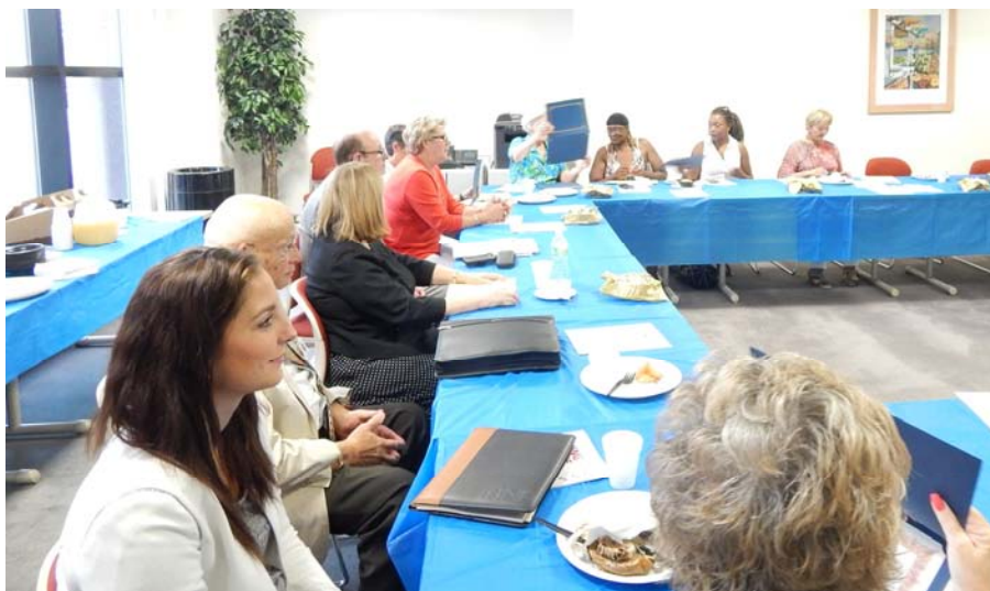
Volunteers were presented with certificates and served breakfast.