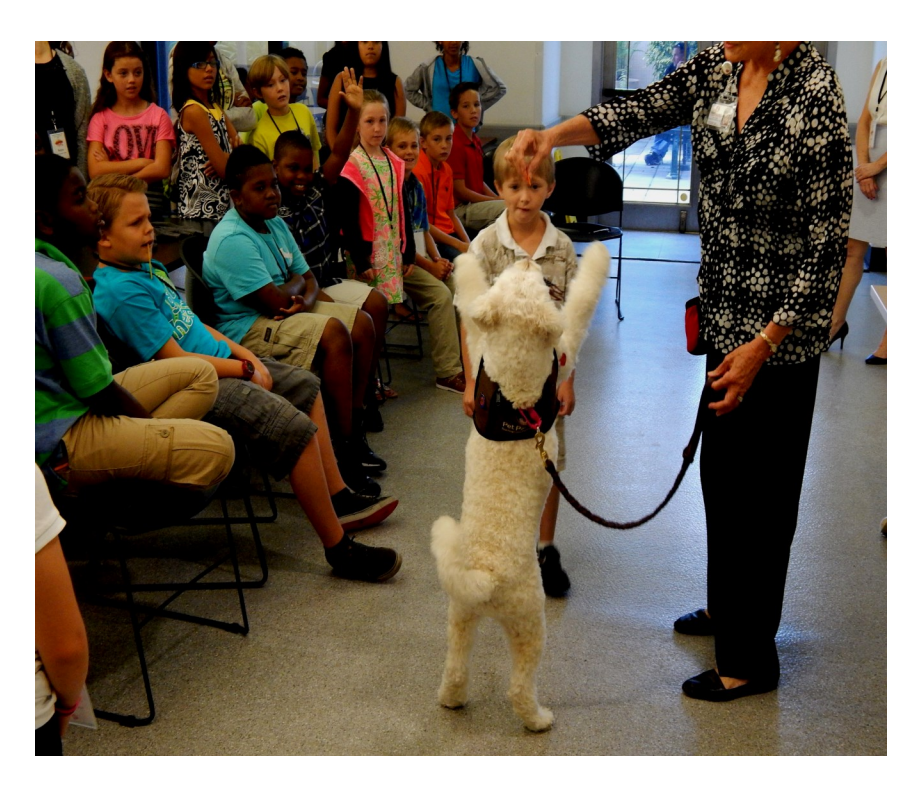
Caring Canine, "Sunshine" performs a trick for the children.