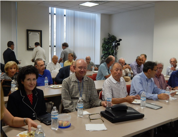
County Family Dependency Meditators