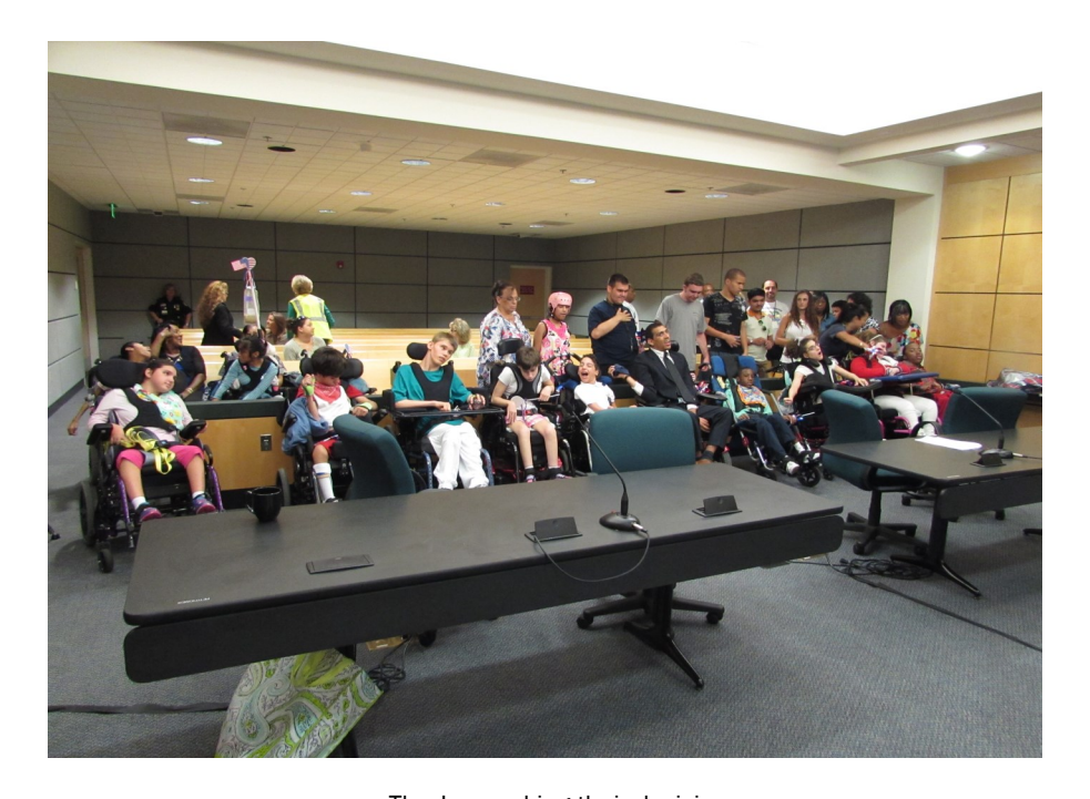
The Jury making their decision.