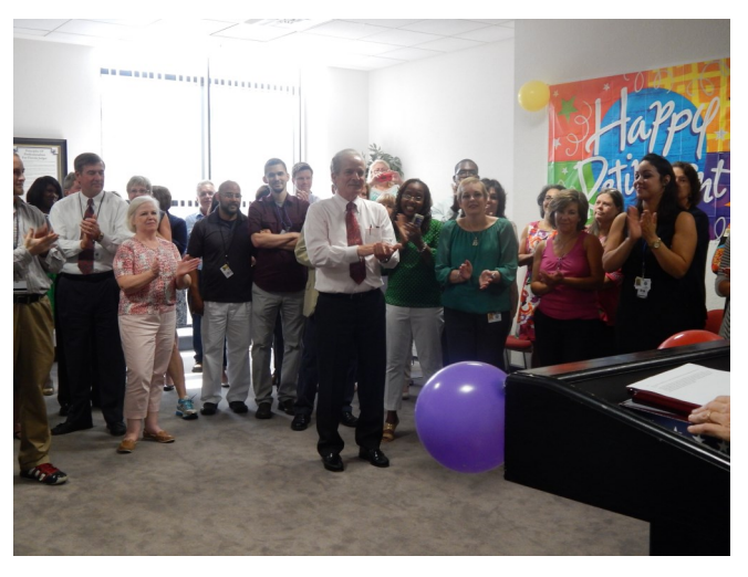
The farewell crowd.