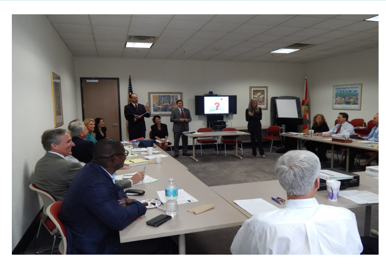
Traffic Hearing Officers during training.