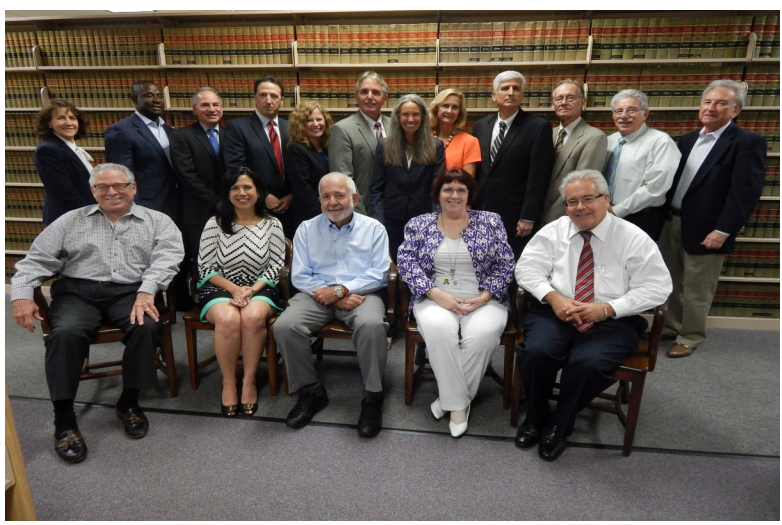
Traffic Hearing Officers Annual Training 2015