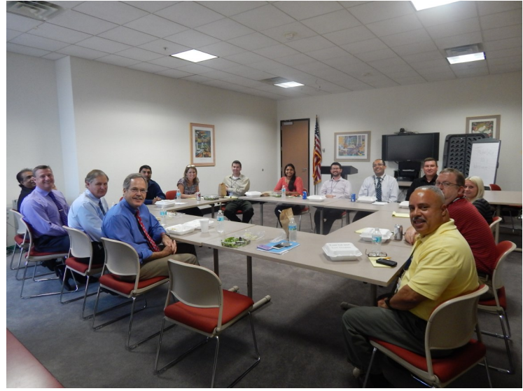
Court IT Team at their Appreciation Luncheon.

The Circuit Courier Published by the Fifteenth Judicial Circuit