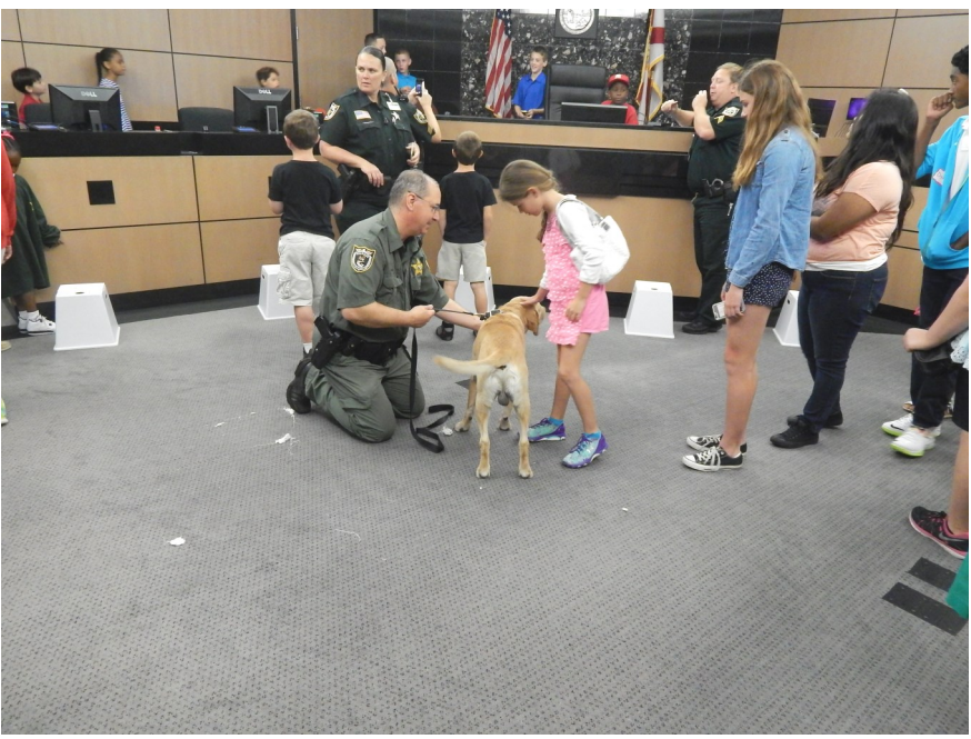
PBSO Canine handler and "Dutch" with the program attendees.

Caring Canine, "Sunshine" greets the children.