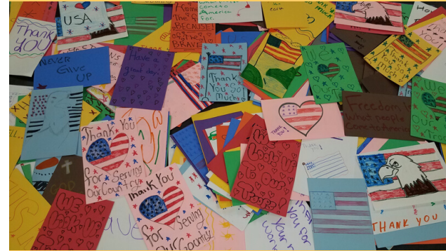
Greeting cards created for Veterans

Entities that collaborated with the program included: local law enforcement; DATA; Choice to Change; (etc. —list them all with a semi-colon in between). At the end (after you list all the entities), write: The summer program concluded with a “Back to School Bash” and the participants received new backpacks filled with school supplies.