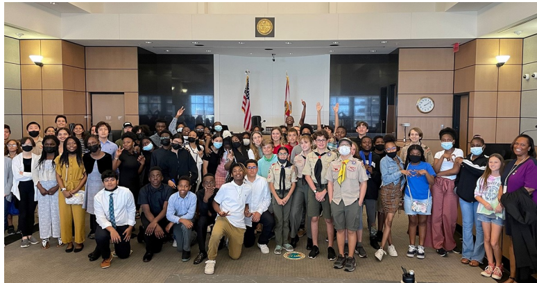
Participants with presenters