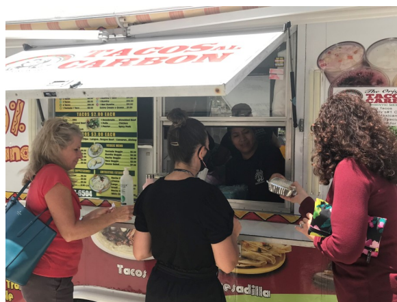
Food on the way!

On Thursday, March 31, the Main Courthouse was visited by a popular local food truck, Tacos Al Carbon. The truck was conveniently parked on the West side of the building. People were able to enjoy tacos, burritos, and more. Special thanks to those who waited patiently in line.