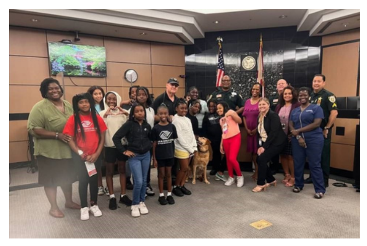
On July 20, the Hon. Cymonie Rowe welcomed a group of young ladies from the Boys & Girls Club of Palm Beach County to the main courthouse. After speaking with Judge Rowe, the students experienced a K-9 demonstration and toured the holding cell, jury room and selfservice center.