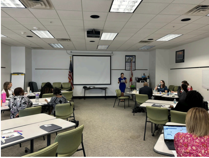
On April 1 and April 3, Court Administration staff held training sessions for judicial and magistrate assistants. The half-day sessions included presentations from directors and managers of the Circuit’s various court programs such as Court Reporting, Court Interpreting, Finance, and Human Resources