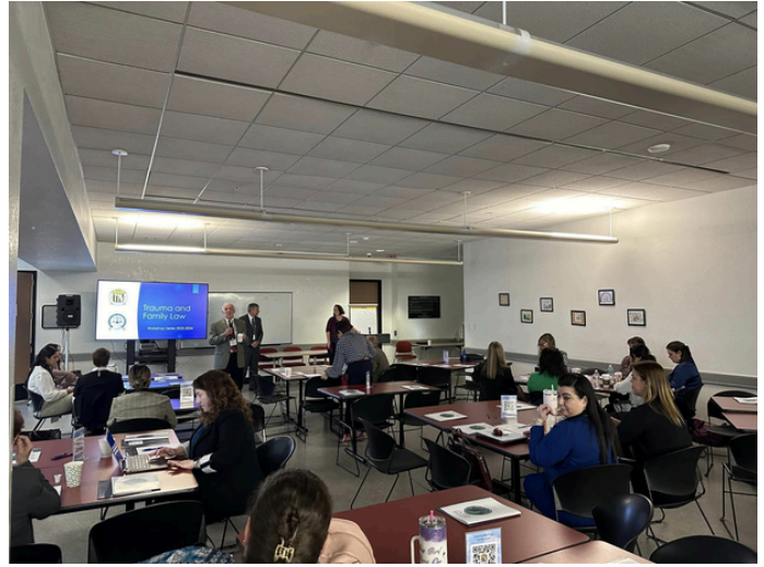
On April 17, in the Main Courthouse, the Florida Bar Family Section, and the Office of State Courts Administrator, hosted a workshop as a part of the Trauma and Family Law series. The full day event covered many topics related to the impact of toxic stress, adverse childhood experiences, self-care technology, and guiding principles for family courts.