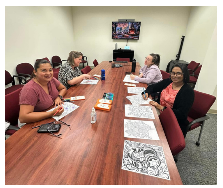
Circuit employees enjoying some adult coloring