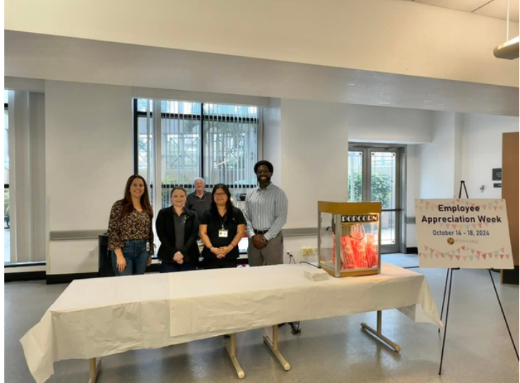
Court Administration staff serve up some fresh popcorn to Circuit employees