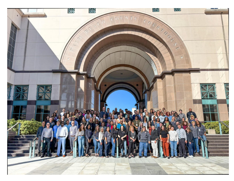
Group photo of 15th Circuit employees

The Circuit appreciates the employees' dedication to assisting with the provision of justice for the citizens of Palm Beach County.