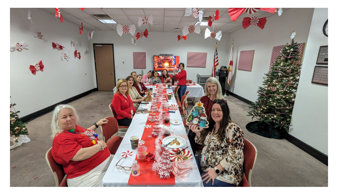
On December 19, the judicial assistants celebrated the holiday season with their annual holiday luncheon, enjoying an array of delicious food, prizes and camaraderie.